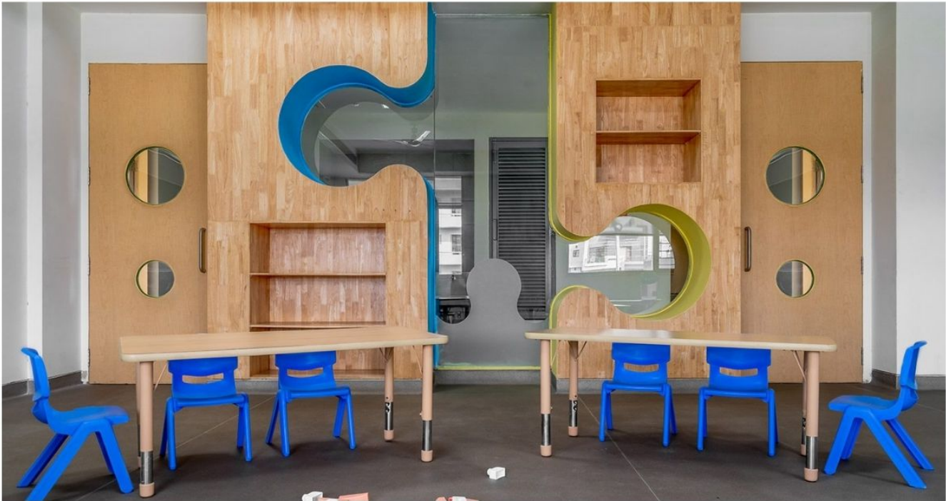
A sit-down interactive play area at our project, the Amity International School in Mohali, combines functionality and exploration through the imaginative use of form, shape and colour.

By recognising the impact of well-designed and stimulating play environments, architects and designers can uncover possibilities of integrating these elements in everyday environments to create holistic spaces around children.