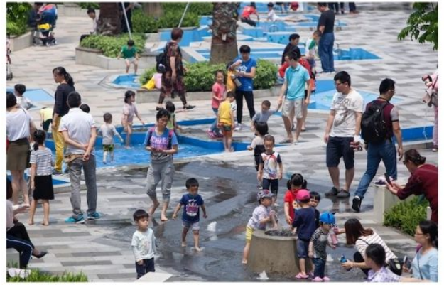
Multigenerational playgrounds, such as the one at COHL Foshan Uni-Mall in Guangdong province, China, are designed to foster social interactions between different age groups and provide a place of respite. The central attraction is a free water park, designed by Aspect Studios around natural elements to connect users with their environment.

The evolution of modern play equipment represents a paradigm shift, where traditional swings and slides now coexist with innovative elements designed to engage the senses, stimulate imagination, and create inclusive environments. Sensory-rich interactive panels, musical elements, and textured surfaces engage multiple senses, fostering cognitive development and imagination while nurturing critical thinking skills. Nature-inspired designs, incorporating natural elements like rocks, logs, and plants, reconnect children with nature, encouraging imaginative play and risk-taking in a secure environment.