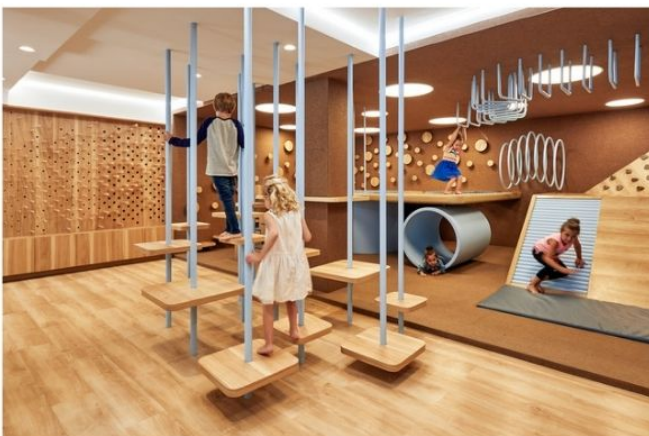
Nia School, A Mexican kindergarten designed by Sulkin Askenazi, is organized to allow children to move freely between different interior spaces, creating a plethora of opportunities to play in both the horizontal and vertical planes. In addition to being functional, the carpentry invites children to climb its walls, go down and then climb ramps and swings