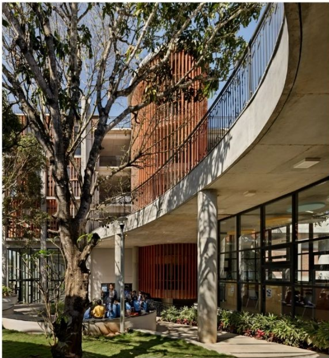
By conceiving the built in harmony with nature, it cultivates in children compassion for their surroundings from an early age, which may not otherwise happen within the technology-fueled isolation of urban life.

We designed Euro School in Bengaluru with the same ethos in mind, featuring a terraced lawn that seamlessly follows the site contours. The design incorporates seating ledges and cosy nooks, complemented by play areas, sand pits, and vegetable gardens. These interventions also serve as outdoor classrooms in fair weather, reshaping traditional learning environments and bringing together the idea of play and learning.